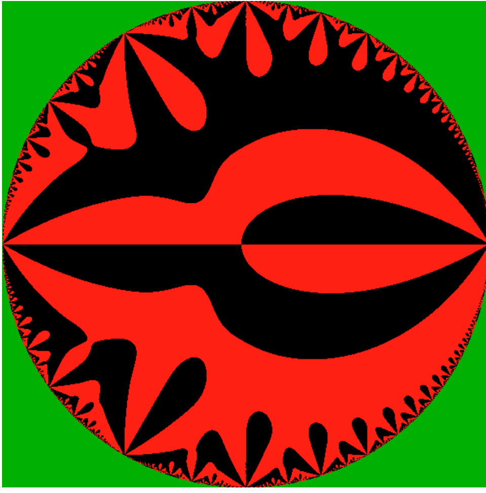
FIGURE 8.2. Phase of P_{-5}(q) on the unit disk